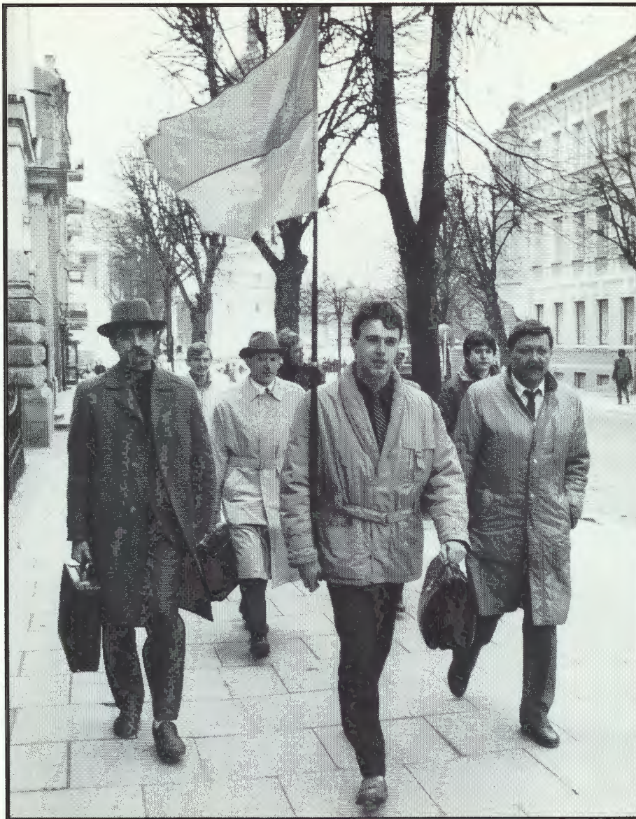
Members of the Ukrainian Nationalist Organization arrive in Vilnius, Lithuania, to voice their support for independence, March 23, 1990.

CovertAction INFORMATION BULLETIN P.O. Box 34583 Washington, DC 20043