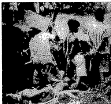
As two men await certain death, a soldier bayonets those at his feet, October 1965. This is one of the very few photographs documenting the massacre.

CIA has used the Wurlitzer and its successors to plant stories and to suppress expository or critical reporting in order to manipulate domestic and international perceptions. From the early 1980s, many media operations formerly the responsibility of the CIA have been funded somewhat overtly by the National Endowment for Democracy (NED).